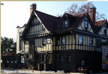
Figure 1 - Overlook, east elevation, 2016.

612 North Front Street Harrisburg, PA 17101