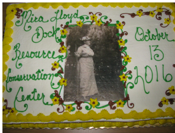
A cake with Mira's image!