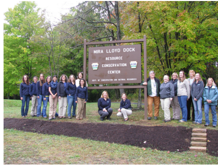
All the women foresters of DCNR at the sign.