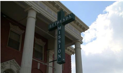
Bethesda Mission at 611 Reilly St.